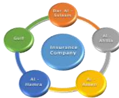
Fig. 2. Insurance company

This paper is structured to provide a comprehensive understanding of the relationship between financial leverage and profitability in the context of the Iraqi insurance sector. The literature review offers an overview of existing studies on financial leverage and profitability, highlighting key findings and gaps that this research aims to address. Following that, the study concepts and terminology section defines crucial terms such as financial leverage and profitability indicators, ensuring clarity in the subsequent analyses. The statistical study description section details the methodology employed to assess the impact of financial leverage on profitability indicators, including the data sources and statistical techniques used. Finally, the conclusion synthesizes the findings and offers practical recommendations for insurance companies, emphasizing the implications for their financial performance and strategic direction.